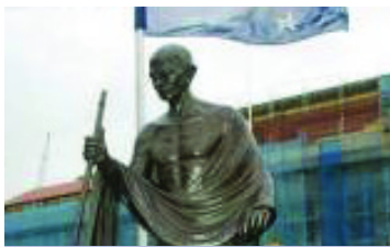
The statue of Gandhi