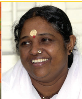
Amma INDIA RELIGIOUS & SPIRITUAL

Argentine Musician of Jewish background, originally from Russia with Israeli, Spanish and Palestinian citizenship. Together with Edward Said - he founded the West Eastern Divan Workshop in 1999, an orchestra formed by young Arab and Israeli musicians, for which he received the Prince of Asturias Concord Prize in 2002 and the Wolf Prize for the Arts in Jerusalem.