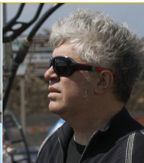
Pedro Almodovar SPAIN TV-CINEMA-THEATRE