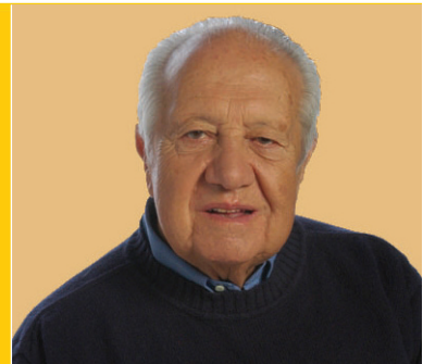
Mario Soares PORTUGAL POLITICS

"It is with pleasure that I endorse the World March for Peace and Nonviolence. For three months, millions of people will carry a universal message of peace across countries and continents, through tropical climates and temperate seasons. Yet, this journey will also symbolise a step forward in humanity's history, away from discord and towards harmony. The World March comes at an important time in world events. With crises and conflicts around the world that threaten the lives and livelihoods of people everywhere, there is increasing urgency to end all violence. I wish all those participating in the event the best of luck; may God bless you and keep you safe. I hope each step brings us closer to a world of peace and nonviolence."