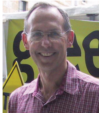
Bob Brown and Elizabeth May

Bob Brown , leader of the Australian Greens, on the 6th of May sent this message to organisers in Australia: "I endorse the World March for Peace and Nonviolence. We could begin by diverting some of the billions of dollars being spent globally on armaments annually to the billion people living in poverty. Congratulations to everyone who