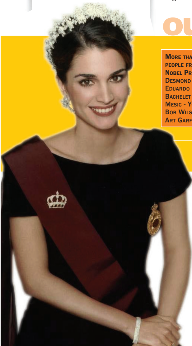
Queen Rania of Jordan